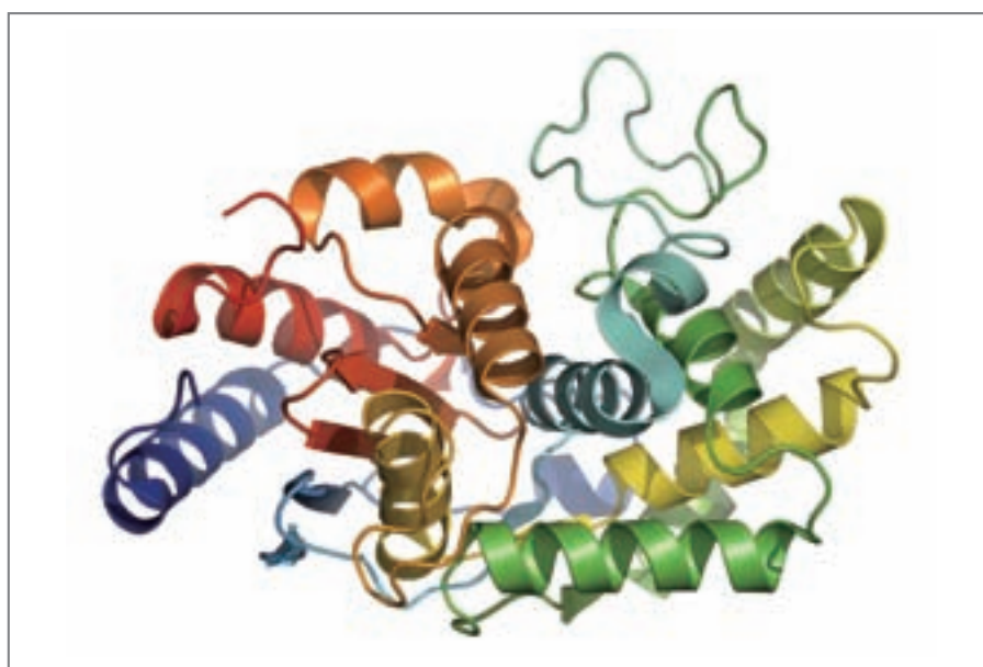
Fig. 1: Overall structure of the catalytic domain of human kidney-type glutaminase. It consists of two domains: domain I on the left has an anti-parallel \beta -sheet surrounded by six \alpha -helices; domain II on the right has seven \alpha -helices. The active site sits on the interface of the two domains.

Dr. Sivaraman from National University of Singapore leads a group of scientists to study human kidney-type glutaminase (KGA) and to solve the structure of the catalytic domain of KGA (cKGA). 4 This group used beamlines I911-3 at MAX-lab (Lund, Sweden), X12B and X25 at Brookhaven National Laboratory, and 13B1 at NSRRC (Taiwan) (Fig. 1). By determining the structures of cKGA with various chemical compounds, including L-glutamine as substrate, L-glutamate as product, BPTES and its derivatives as inhibitors, they drew the following conclusions. cKGA consists of two domains, I and II. The active site is located at domain II, and forms several hydrogen bonding contacts with the bound ligand. BPTES binds at a previously unknown location at the dimer interface of cKGA, approximately 18 Å away from the active site. The intrinsic symmetry of BPTES interacting with the hydrophobic clusters of both cKGA in dimer forms an allosteric pocket (Fig. 2). The binding of BPTES induces a movement of a